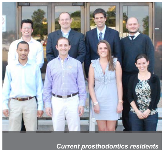
Current prosthodontics residents