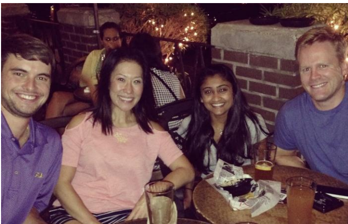
Relaxation time for the first year residents!