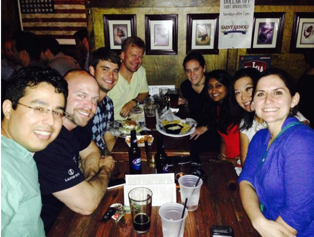
The class of 2015 and 2016 catch up together!