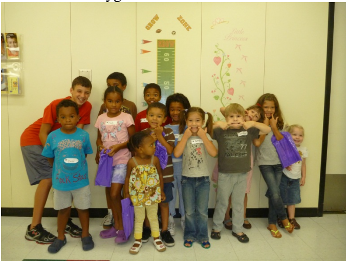
Classical Conversations students tour the dental clinic and show us their smiles!

In August the residents had an early opportunity to share their enthusiasm for dentistry with a group of young children from Classical Conversations, Metairie Campus . The residents introduced the children to the pediatric dentistry clinic and discussed oral hygiene and diet.