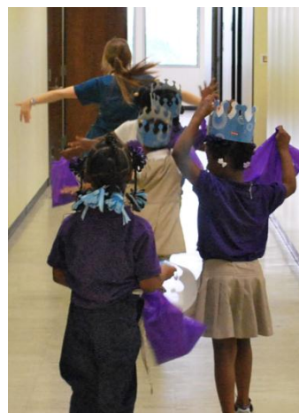
A Dental Hygiene student volunteer skips down the hall with students on GKAS Day