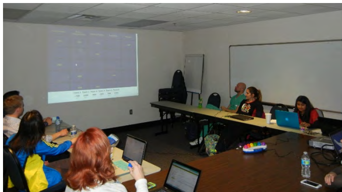
The pediatric dental residents and faculty review seminar information with a game of Jeopardy!